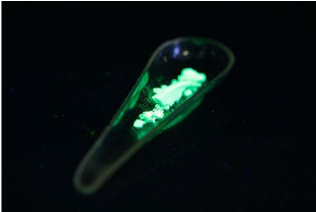
Excitation color at 366nm

All applications using this product should be thoroughly tested prior to approval for production.