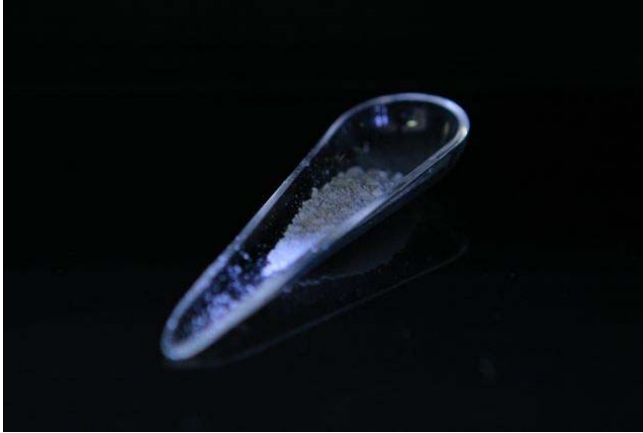
Appearance at visible light